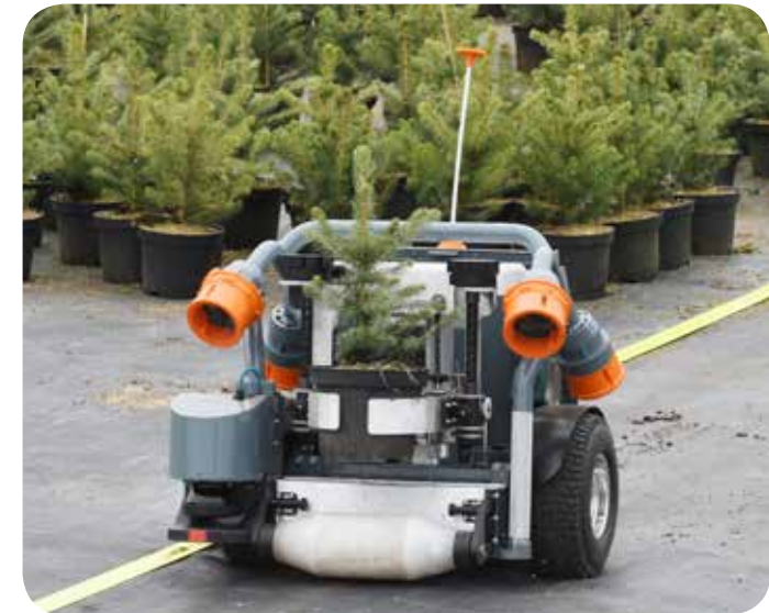
Nursery robot HV-100 on duty